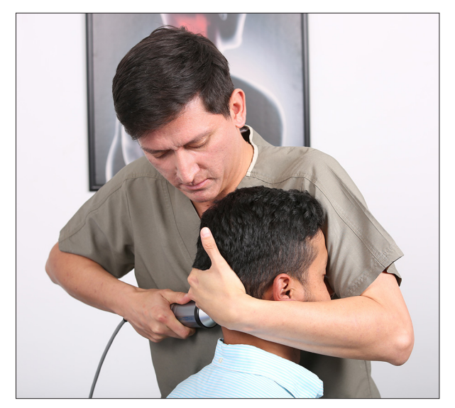
Figure 3. Physician performing the Atlasprofilax<sup>®</sup> method on the patient's suboccipital area.

be due to spontaneous remission within the parameters observed in other studies of similar cases of disc extrusion. However, it is interesting to note that despite the chronicity and severity of the patient's described symptoms - correlated and consistent with the disc herniation, with an onset of more than 5 years - such spontaneous regression would have occurred much earlier, since spontaneous regressions occur at 4 months to 2 years after herniation. It is therefore feasible to conclude that the Atlasprofilax therapy could have contributed to the reabsorption. Further studies with larger sample sizes are required to answer this question. From a clinical point of view, it is noteworthy that none of the patient's symptoms had improved in the 5 years prior to the Atlasprofilax therapy. The sciatica disappeared within 1 week after the treatment, and symptoms not directly related to the disc herniation (eg, brachialgia and trapezius pain) improved significantly shortly after therapy. The symptoms associated with the disc extrusion and those with other origins were greatly reduced, and mostly disappeared, over a period of 5 years. No relapse or